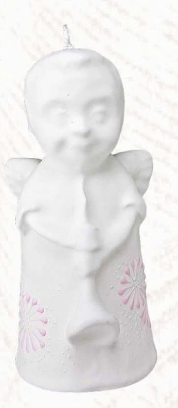
C 387 Girl