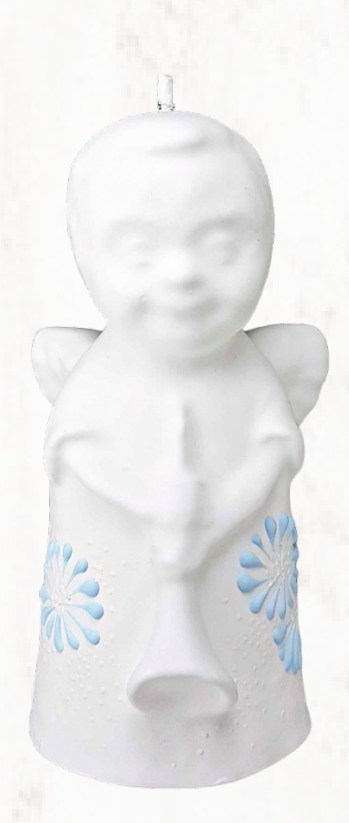
C 387 Boy